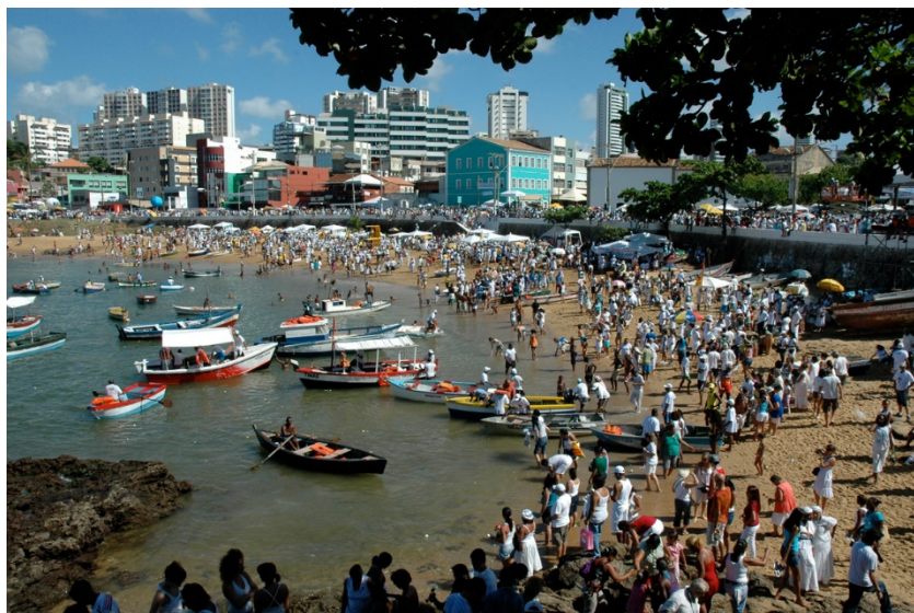
Festa de Yemanjá in Bahia, Brazil.

Get more info about the film and view trailer.