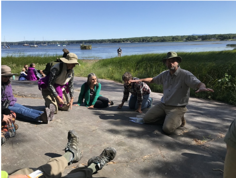
Learning about the Shelburne Bay area during a past Sacred Waters event.