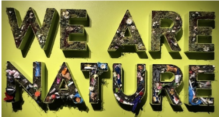
Photo from Living in the Anthropocene exhibit, Carnegie Museum of Natural History

transportation; environmental Justice; heating & cooling our buildings; expanding a renewable, resilient, local energy system; and implementing a suite of smart growth policies." Read more on the VPIRG website .