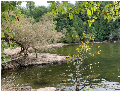
Little Eagle Bay during Equinox Event