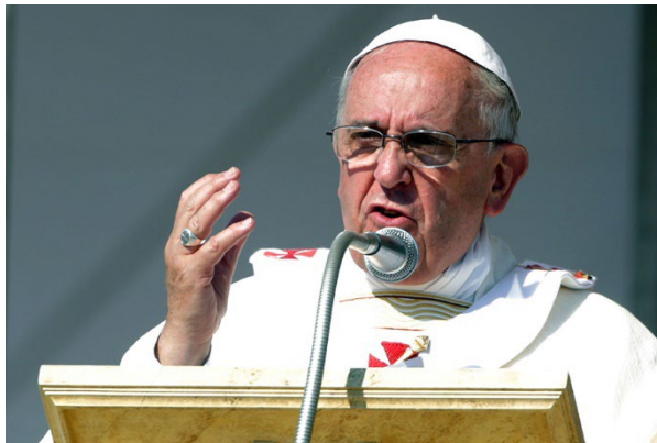
Pope Francis.