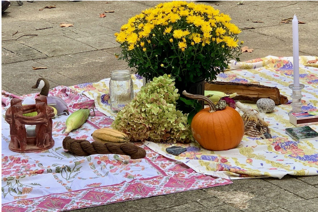
Sacred Centerpiece at VTIPL Equinox Event

Vermont Interfaith Power & Light A faith-based response to global warming