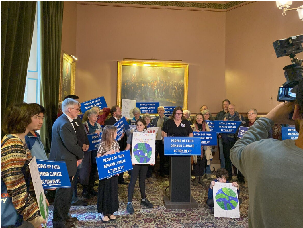
Faith Climate Action Day Press Conference