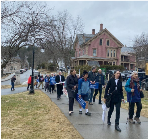
Singing & Marching to the Statehouse