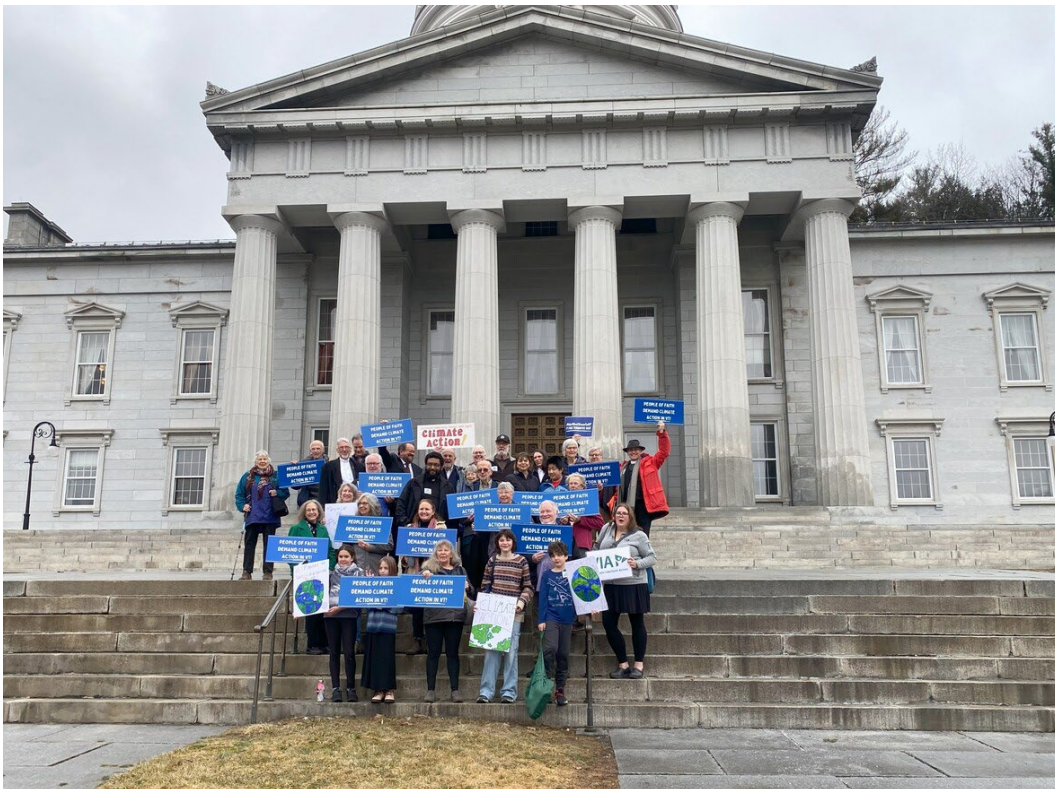
At the Statehouse