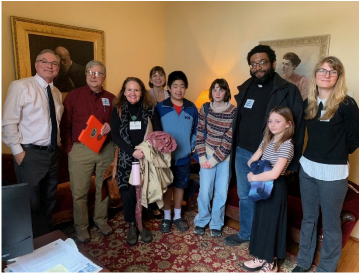
VTIPL Members meet with Senate Pro Tem Phil Baruth