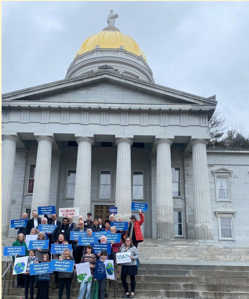
Faith Climate Action Day, 2024